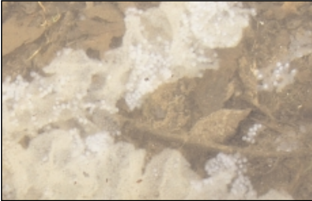
Eggs from frogs or toads